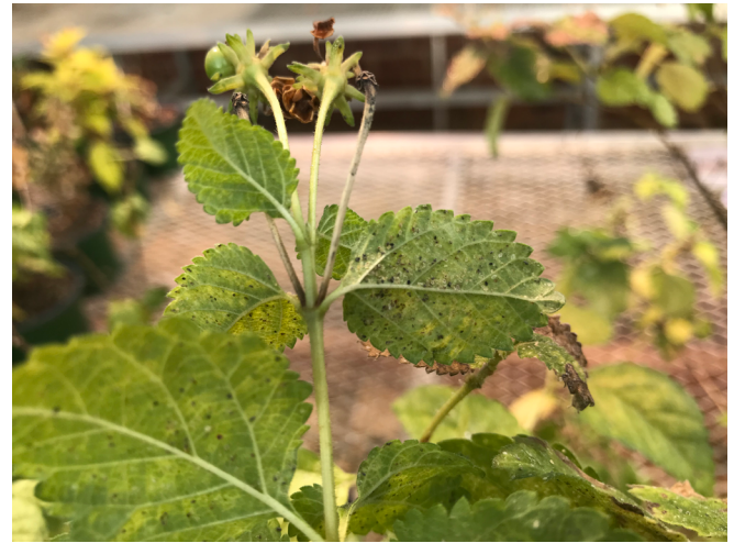
Figure 7. Developing nymphs of silverleaf whitefly causing damage to host plants.