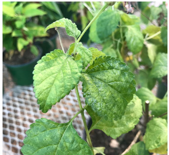
Figure 8. Yellowing of leaves caused by silverleaf whiteflies feeding on lantana.