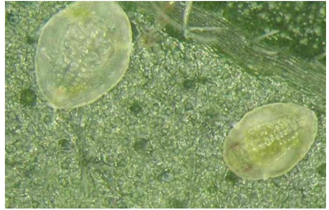
Figure 6. Pupae of silverleaf whitefly.

In nurseries, whitefly infestations are a persistent problem as infested plants are continuously introduced. Preventing the introduction of whitefly-infested plants to the nursery should be the primary strategy for effective whitefly management. To do this, regular inspections and immediate insecticide applications are necessary to protect plants from whitefly introductions once infested plants are detected in the facility. Isolating newly introduced plant stock for 1 to 2 weeks before planting also can reduce infestations among nursery plants. Whiteflies are particularly attracted to plants that are at bloom, especially those with yellow flowers. Regularly monitoring plants and physically removing infested leaves can reduce the whitefly population. The prompt removal of plant residues and weeds from the nursery may help