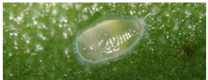
Figure 5. Nymph of silverleaf whitefly.