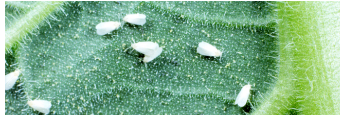
Figure 2. Adult silverleaf whitefly infestation on the underside of a tobacco leaf.