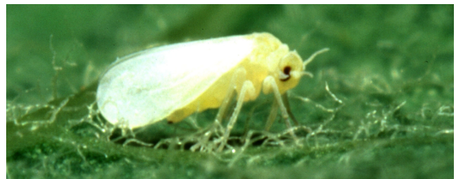
Figure 3. Adult silverleaf whitefly ( Bemisia argentifolii or Bemisia tabaci biotype B)